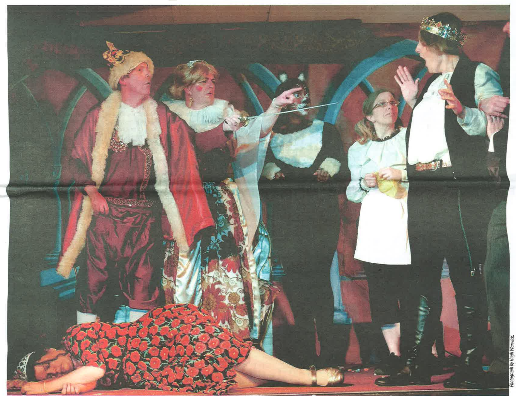
The last night of The Florence Park Panto saw the Community Centre packed with friends and neighbours, all there to enjoy the show. TURN TO PAGE 3

Oxford City Council Consultation: 18 February to 15 April 2016 Private Sector Housing Policy