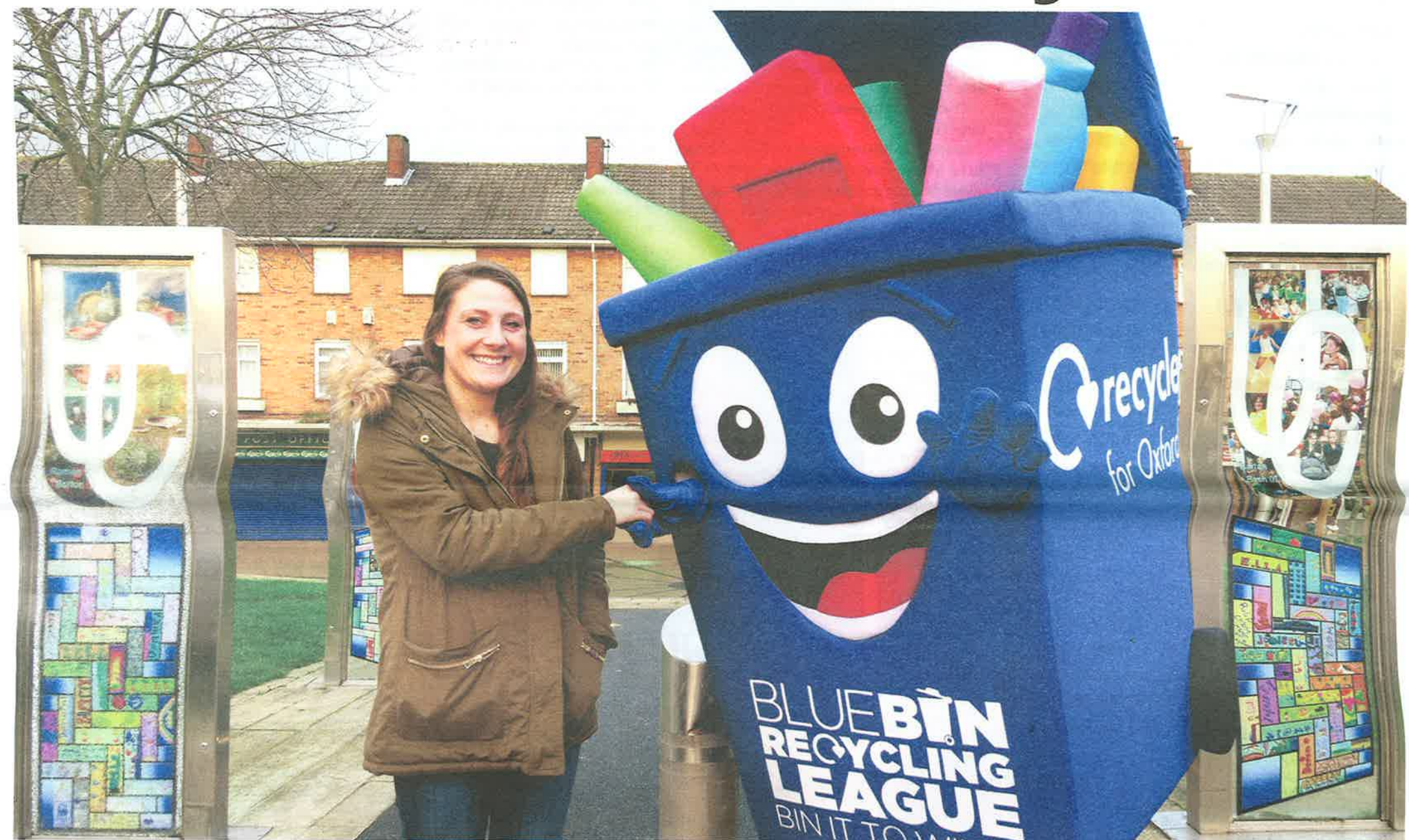
The Blue Bin Recycling League is a government funded rewards scheme, giving you the chance to win exciting prizes for yourself and your community by recycling more! TURN TO PAGE 3